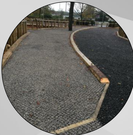
Backfilled with gravel