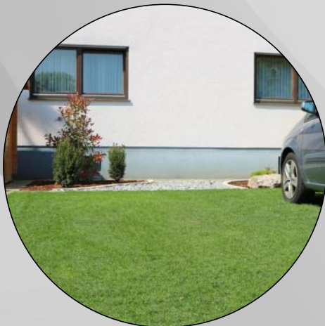
Backfilled with seed/grass